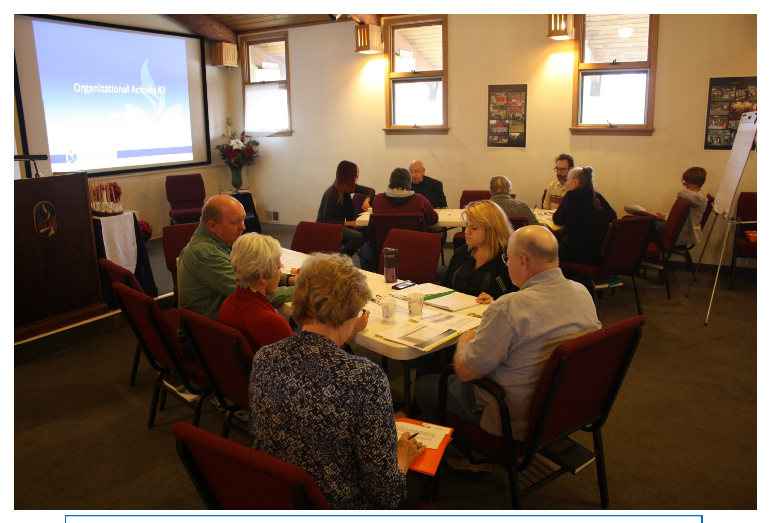
Engaged in the process.

Being comfortable in a leadership position is a skill anyone can learn: comfort level increases when you learn how Second Unitarian does its work and gain confidence in your own leadership skills. (Continued)