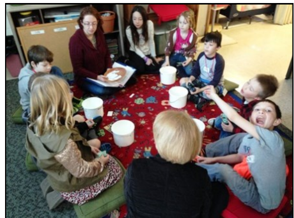
The elementary kids learning about Time, Talent and Treasure.