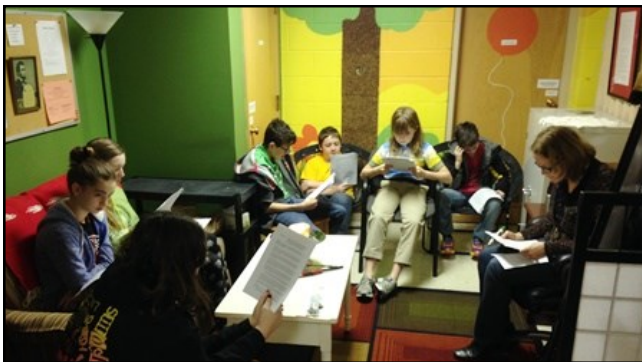
Our middle school class practicing for the intergenerational service on February 15.

* Perhaps a little too close physically at times: the preschoolers complain about the middle schoolers being too loud! What can I say... they're UUs and there's nothing predictable about any of us!